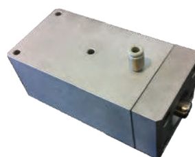
Special Chamber Ref: 06-01-0127